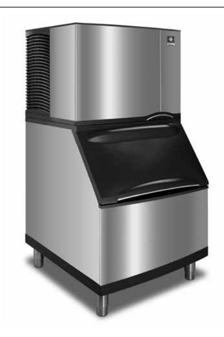
SY-0504A Ice Machine on B-570 Bin